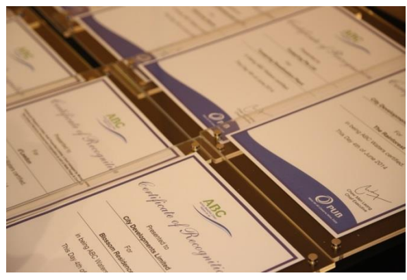
ABC Waters Certificates for award recipients

The seminar coincided with the launch of ABC Waters Design Guidelines 3<sup>rd</sup> edition, as well as the third ABC Waters Certification Ceremony. The Active, Beautiful, Clean Waters (ABC Waters) programme is PUB's long-term strategic programme to realise the full potential of Singapore's water infrastructure. Launched in 2006, it aims to transform Singapore's pervasive network of drains, canals and reservoirs into beautiful and clean streams, rivers and lakes that are vibrant and aesthetically pleasing, for all to enjoy.